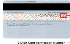
3 Digit Card Verification Number

Your credit card will not be charged until we receive final approval from you on the quantity and cost.